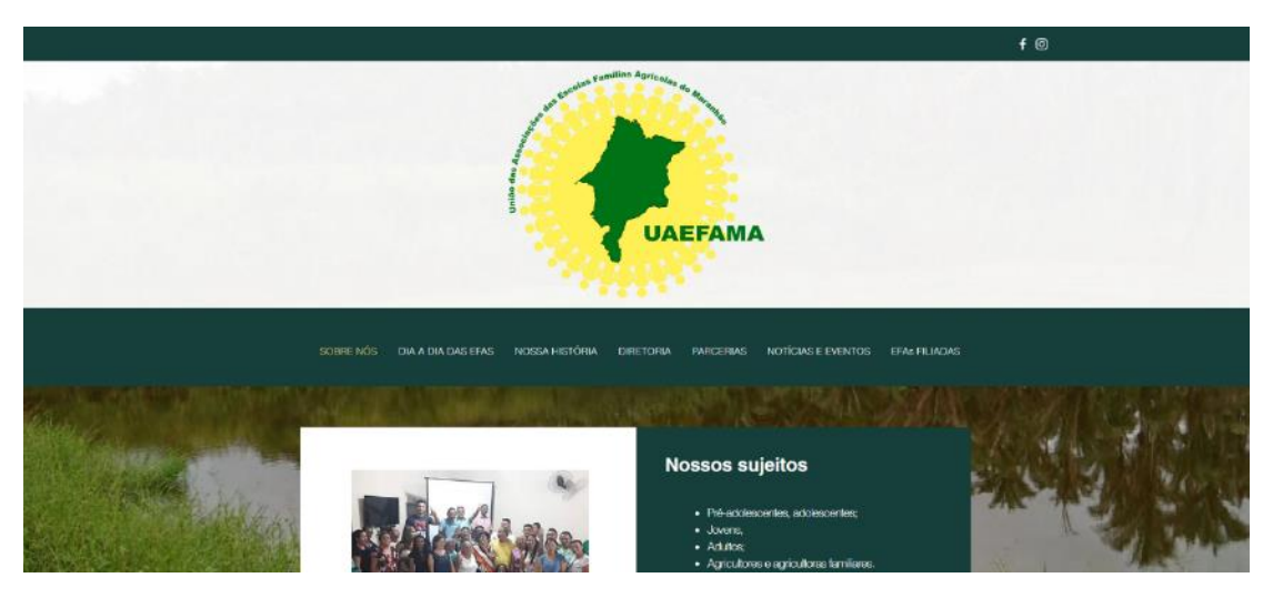
Figure 3 - Screenshots of the web pages built and published during the extension project "Sharing experiences with digital technologies," developed by UFMA, from 2020 to 2021

(a) Screenshot of the UAEFAMA web page (10/27/2021).