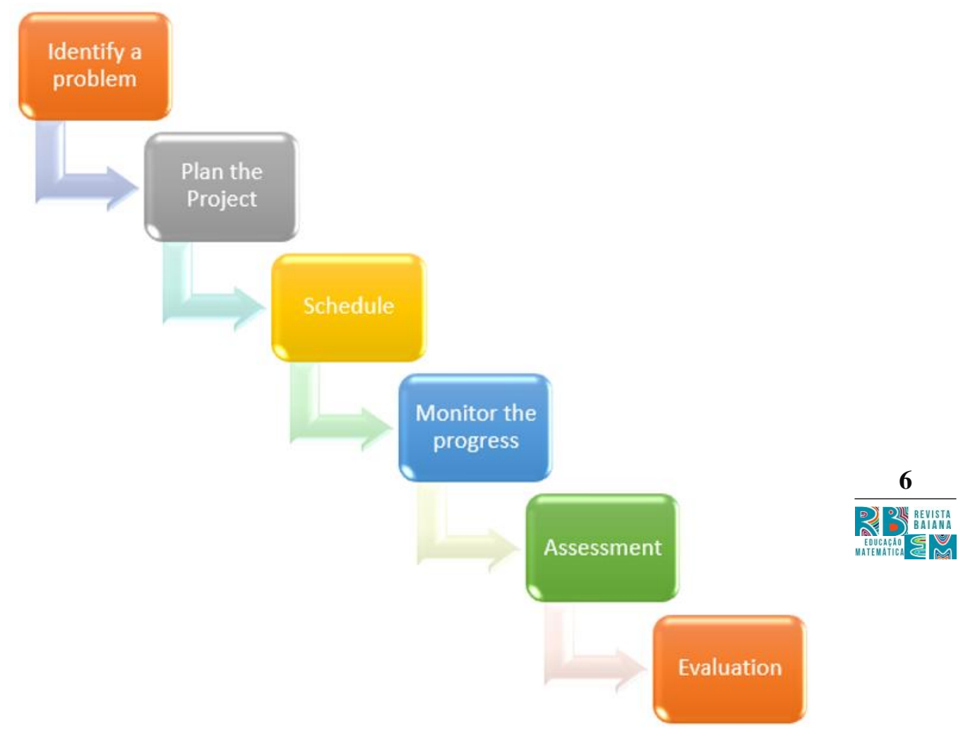
Figure 2: Stages of a Learning Project (adapted from Bender, 2014)

participation and involvement is crucial during all stages of PBL. Similarly, the use of real-life situations and the attempt of understanding and solve problems became a necessary motivation.